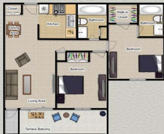
2 Bedroom | 2 Bath Prices Start at: $855/ month

Cider Mill offers a variety of floor plans and rental rates. Renovated homes available!