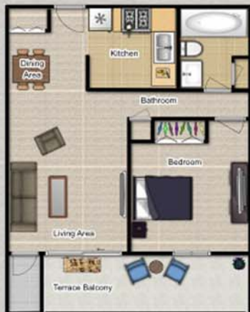
1 Bedroom | 1 Bath Prices Start at: $665/ month