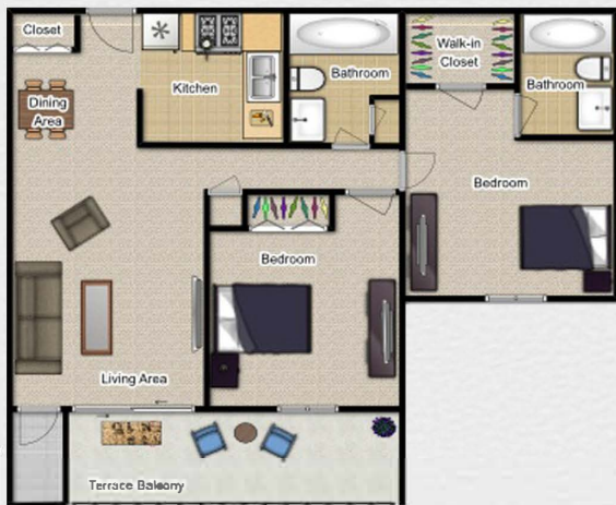
2 Bedroom | 2 Bath Prices Start at: $995/ month

Cider Mill offers a variety of floor plans and rental rates. Renovated homes available!