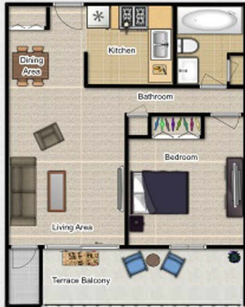
1 Bedroom | 1 Bath Prices Start at: $760/ month