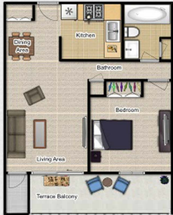
1 Bedroom | 1 Bath Prices Start at: $820/ mo.